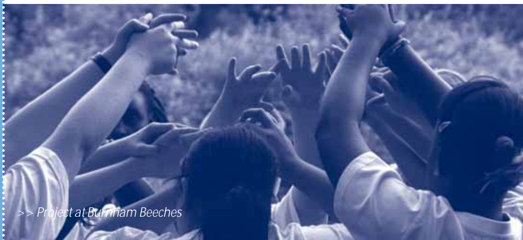
>> Project at Burnham Beeches