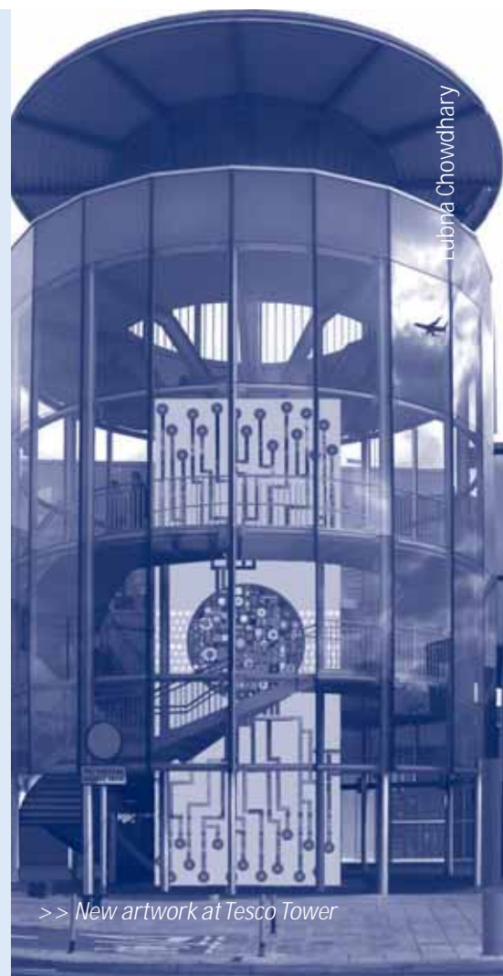
>> New artwork at Tesco Tower

Further information is available at www.lubnachowdhary.co.uk