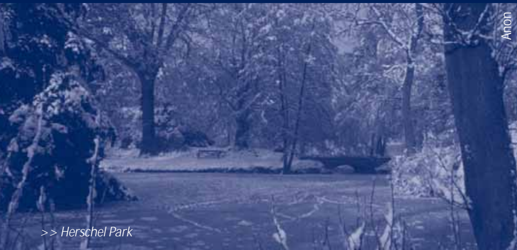
>> Herschel Park