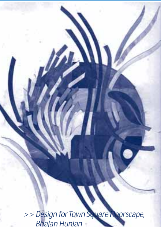
>> Design for Town Square Floorscape, Bhajan Hunjan