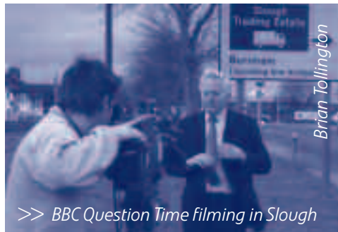
>> BBC Question Time filming in Slough