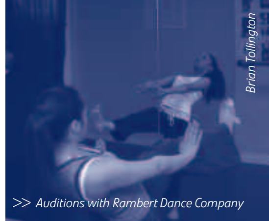
>> Auditions with Rambert Dance Company