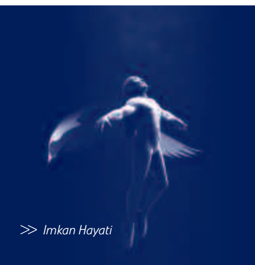
>> Imkan Hayati