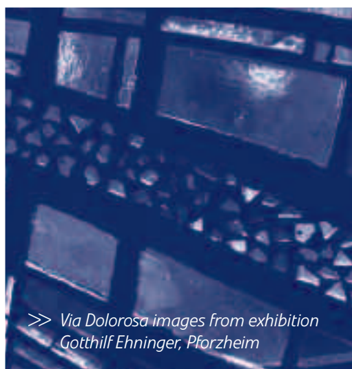
>> Via Dolorosa images from exhibition Gotthilf Ehninger, Pforzheim