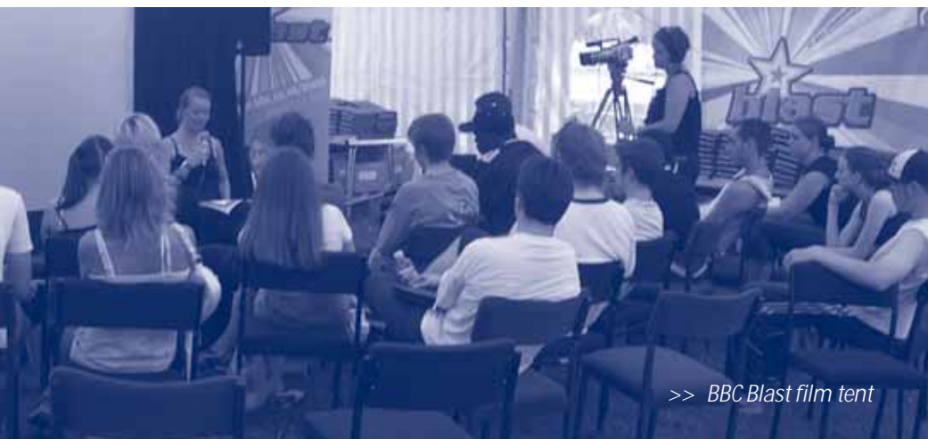
>> BBC Blast film tent

Further information about BBC Blast is available on their website: www.bbc.co.uk/blast