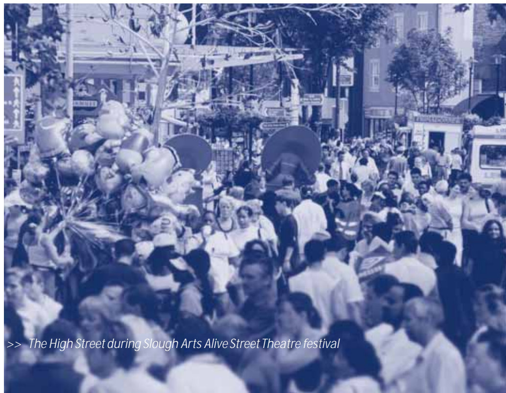
>> The High Street during Slough Arts Alive Street Theatre festival

Please return the marketing card to: Arts Development, Slough Borough Council, FREEPOST (SCE 8944), SLOUGH, SL1 3BR