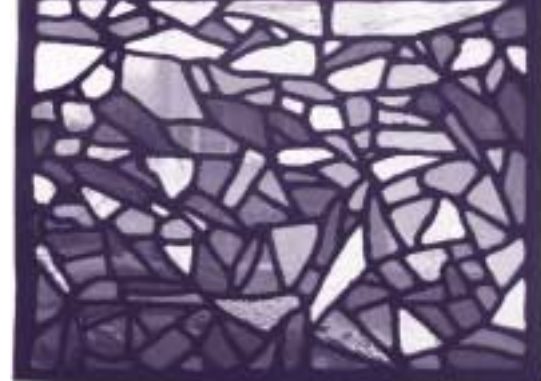
>> Stained glass, recent ITHACA project