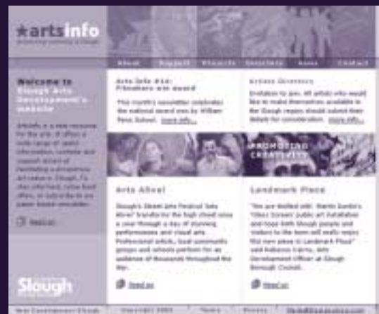
>> The homepage of *artsinfo

For further information contact 01753 875667/875576.